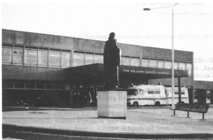
The comment in an appraisal of the William Harvey Hospital, Ashford, Kent, shortly after it was opened might serve both as an epitaph to much NHS hospital planning and as a reminder of the limits of planning: "The 120 bed units cannot function as designed, but thanks to ingenuity and tolerance they are working reasonably well."

Of more general use to the tiro planner is the Introduction to Capital Planning manual, to be published by MARU (with DHSS support) next year. Together with an introductory video, it is designed to teach the basic procedures of capital project planning to those new to it. It covers, with admirable clarity, how capital planning fits into general NHS planning, the stages of planning, the role of the project team, Capricode procedures, and cost control, and it includes a section on understanding drawings as well as a glossary of terms. It is long overdue.