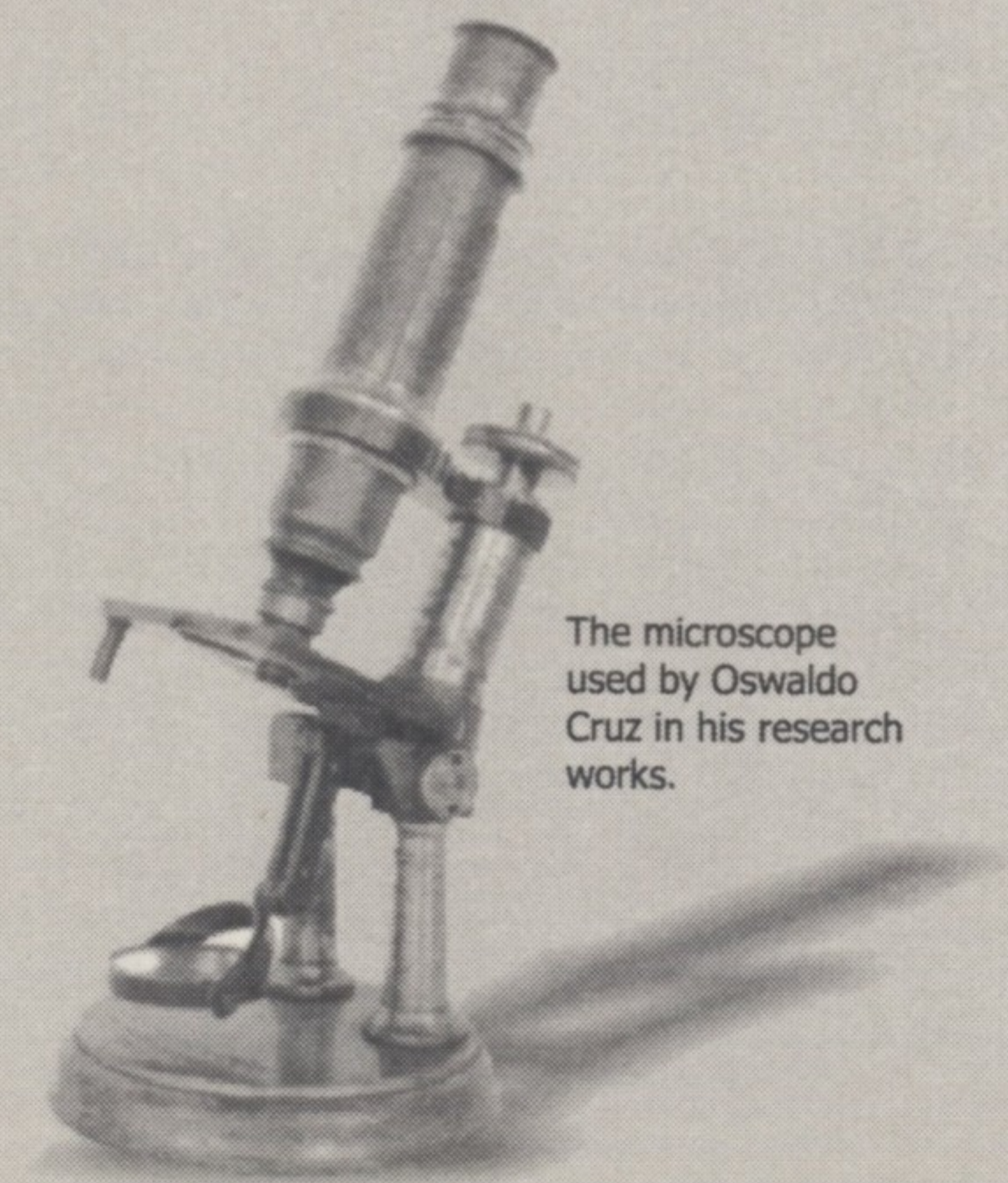
The microscope used by Oswaldo Cruz in his research works.

160 scholarships for scientific introduction are offered.